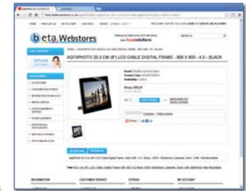
SEARCH ENGINE OPTIMISED PRODUCTS