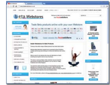
EYE-CATCHING AND USER FRIENDLY DESIGN